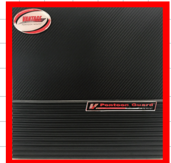
Black Carbon Fiber Pontoon Wrap & Black Pontoon Guard