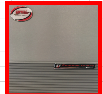
Silver Brushed Aluminum Wrap & Grey Pontoon Guard