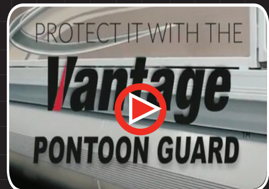
Pontoon Guard Video