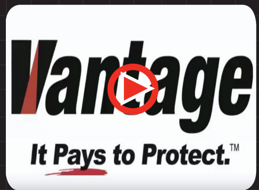
Tube Transformation Video