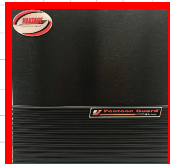
Black Brushed Aluminum Wrap & Black Pontoon Guard