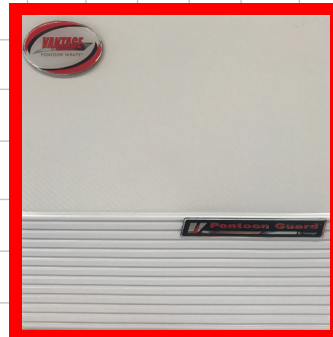
White Carbon Fiber Pontoon Wrap & White Pontoon Guard

Wrap Film and Pontoon Guard colors may be mixed and matched.